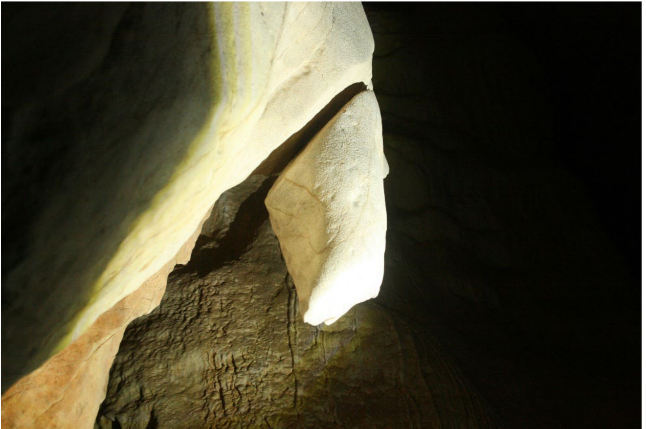
Figure 12: Rock pendant in Chalkers Retreat is almost worn through.