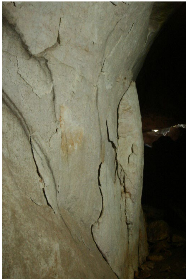
Figure 2: Platey exfoliation, Upper Marble Way near Victoria Arch.

The plates are quite delicate. Part of the passage may have been ice-filled, expanded and cracked the bedrock. Later, it would have flaked off by unloading once the ice melted away. These occur in several places such as Upper Marble Way and Creek Cave Overflow.