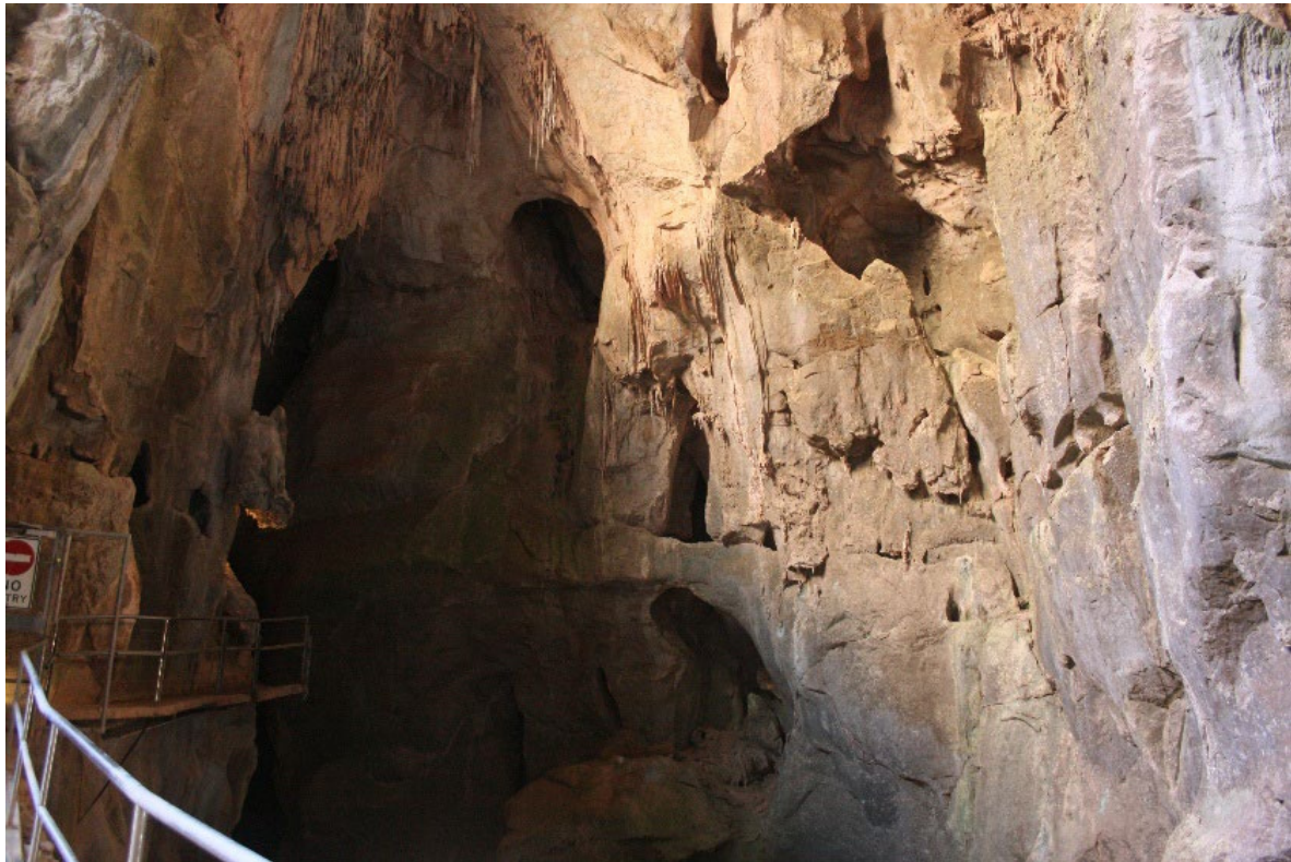
Figure 3: Elongated holes in Victoria Arch.