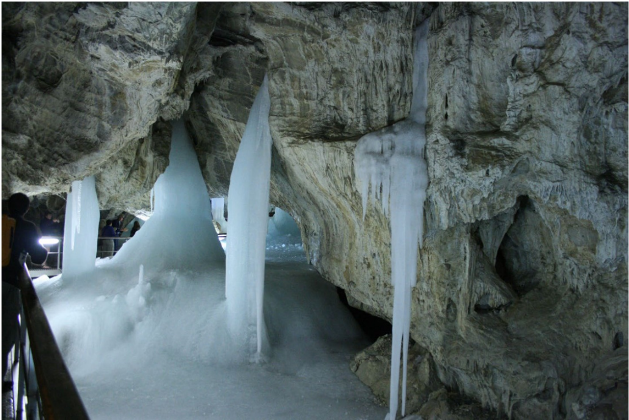
Figure 1: Demänovská Ice Cave in Slovakia in July, 2013.