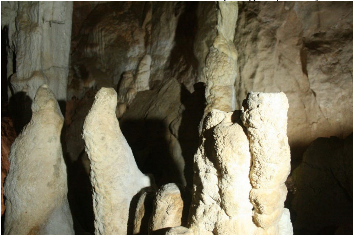
Figure 10: Broken and apparently-bent stalagmites in The Colonnades.

for other causes, such as wind deflection, drip point movement, subsidence and so on. Figure 10 shows some apparently-bent stalagmites which broke at the same height. In the background are cracked columns and a couple of apparently-bent stalagmites.