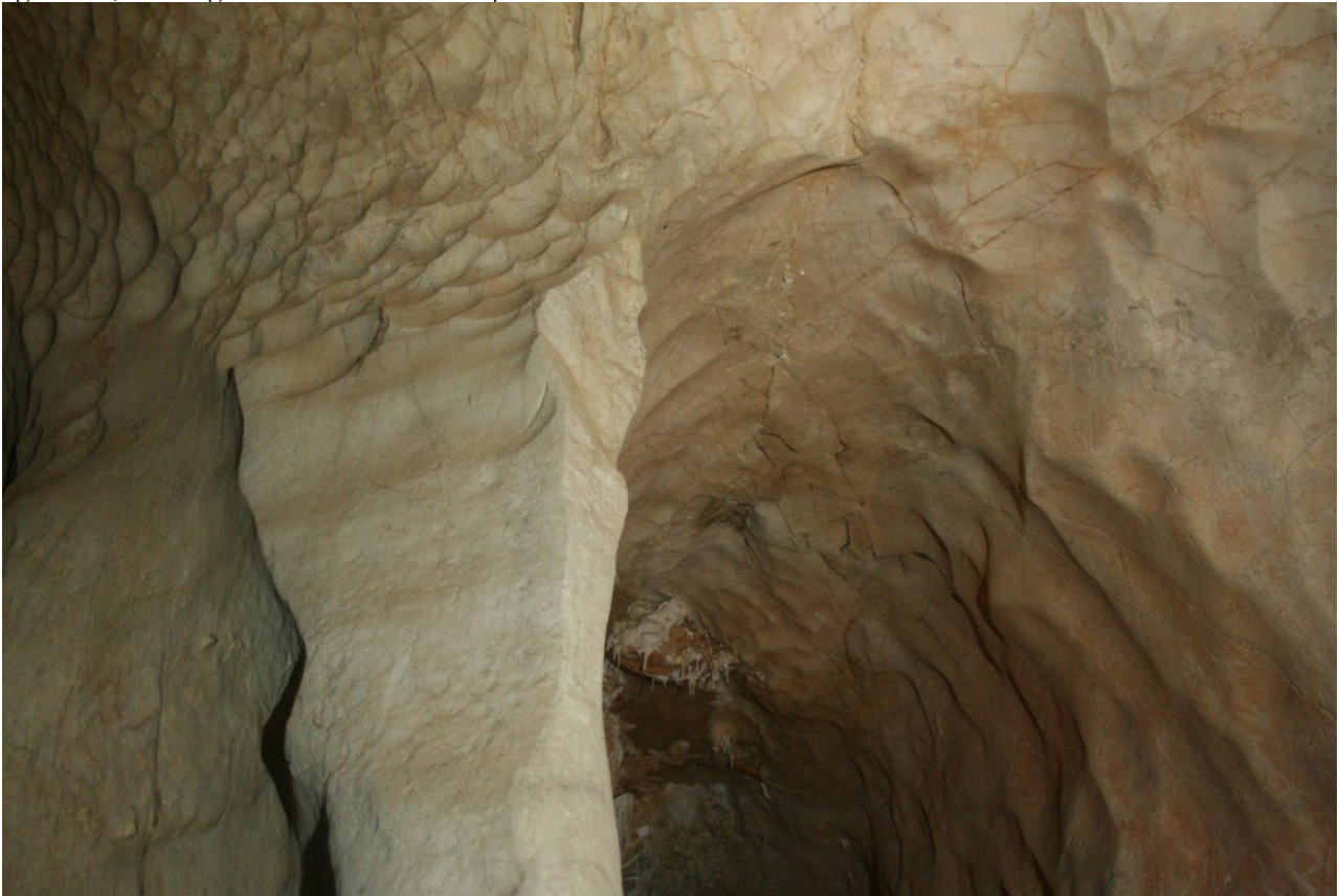
Figure 11: Broken bedrock pendant in The Drawing Room.

missing. A rock of similar shape to the missing bit is embedded in nearby flowstone below. In Figure 12, a bedrock pendant is not quite worn through. Elsewhere in the cave, pendants are lying on the floor.