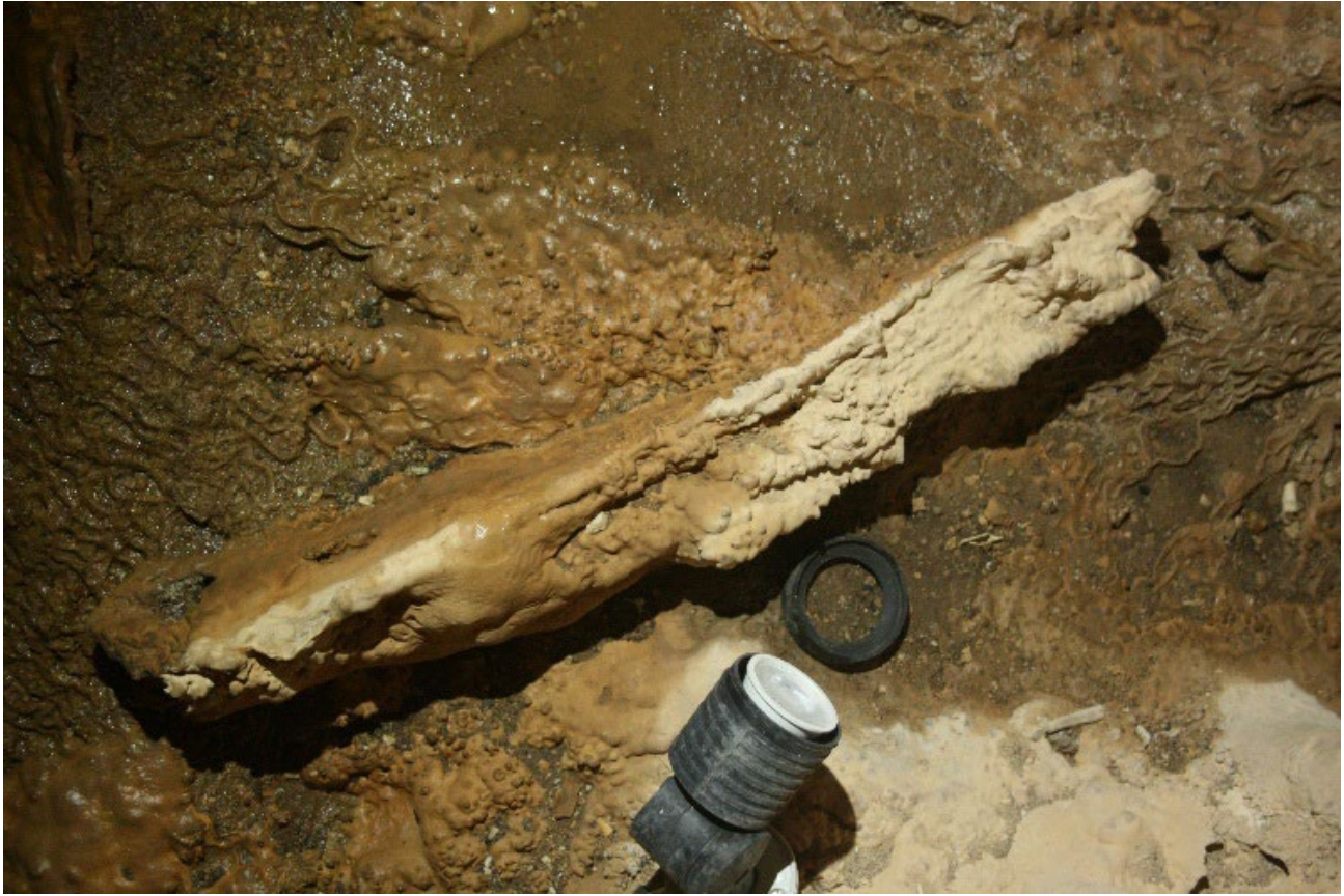
Figure 13: Possible cryogenic ridges on broken stalactite in Upper Marble Way