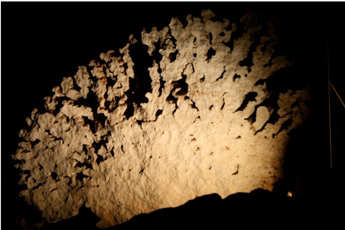
Figure 7: End view of lower half of “Large Broken Stalactite”, looking upstream.