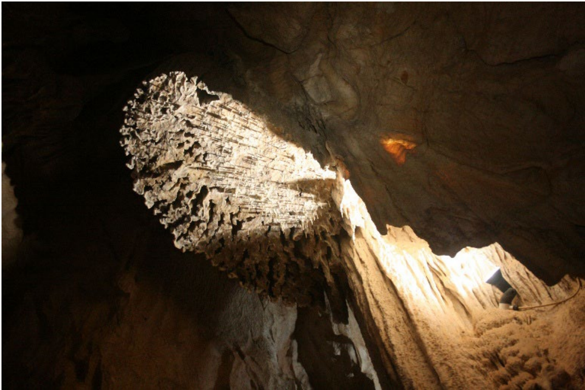
Figure 6: The “Large Broken Stalactite” upper half.