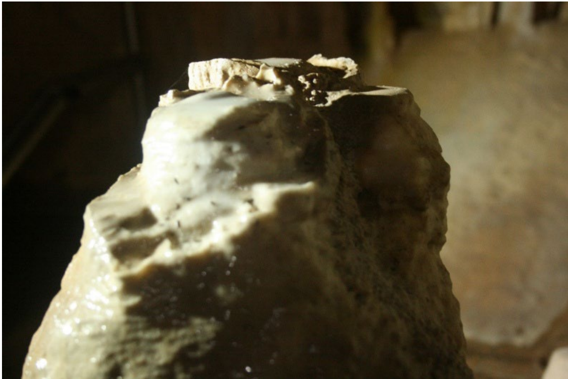
Figure 9: Broken stalagmite in Upper Marble Way.