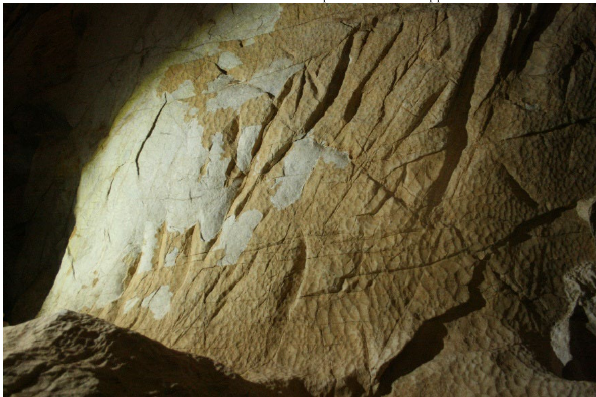
Figure 4: Bedrock in Creek Cave with scallop removal, exfoliation, and rock grooves.

with platy exfoliation and grooves in the rock as shown in Figure 4. Grooves may have been caused by conventional solution, or they could be caused by ice pressure with entrapped rock debris.