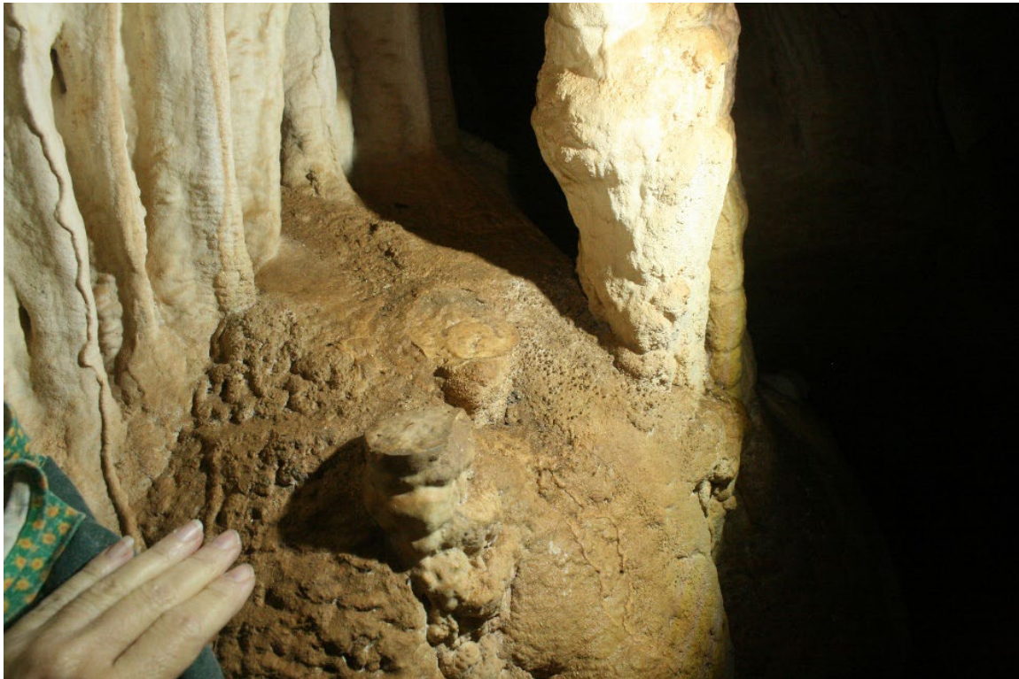
Figure 14: In Chalkers Retreat there are many “dribbles” of calcite and “concrete” flowstone.