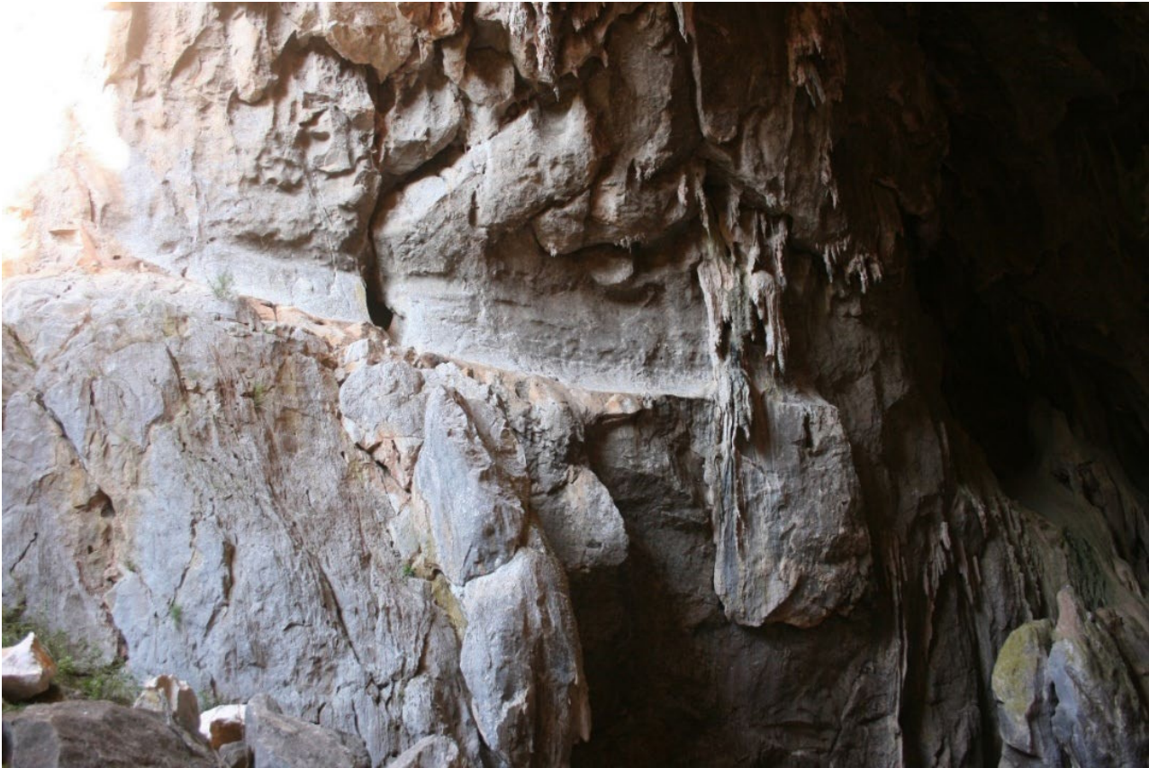
Figure 5: Bedrock grooves in Victoria Arch.

This is in contrast to the current streamway which is well-scalloped. They occur at different heights in the Arch, for example, Figure 5, and pre-date the stalactite shown in the figure.