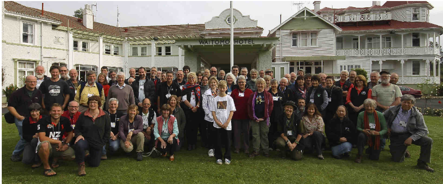
Conference Photo, Waitomo Caves, New Zealand