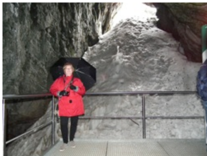
The Natural Entrance as viewed from the Cold Trap Chamber.

9.95 km long and has seven tunnels, eight galleries, twelve bridges and many retaining or supporting walls [3] .