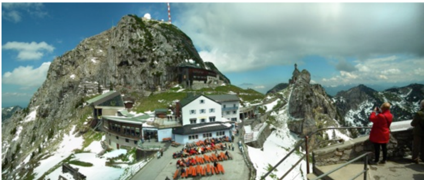
Panoramic view of the visitor facilities and surrounding landscape.