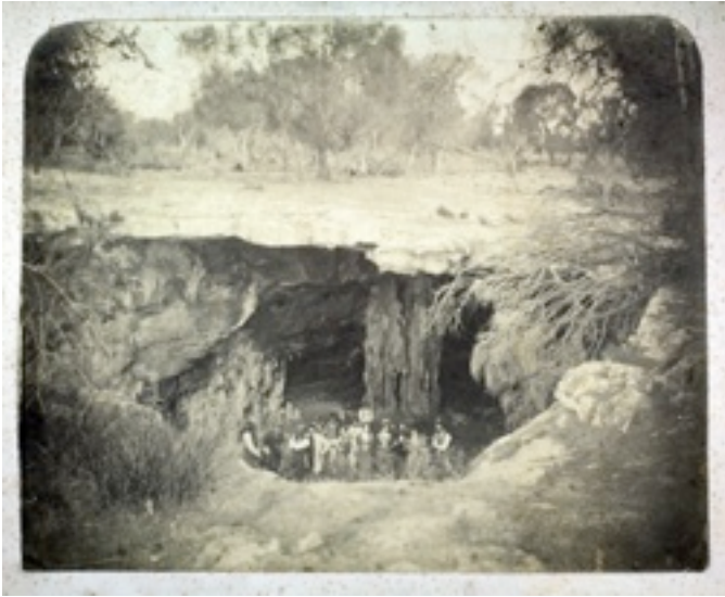
Figure 10. Group of visitors, Blanche Cave, Naracoorte c. 1890