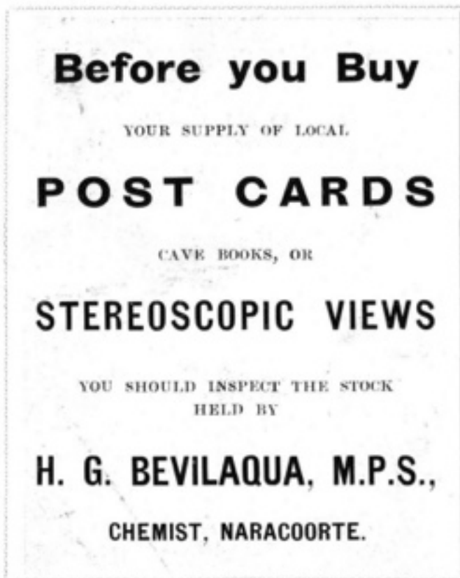
Figure 7. Advertisement from State Tourist Bureau booklet, 1909/1910, The Naracoorte Caves: "How to reach them" . From page 30 (top) and 28 (bottom).