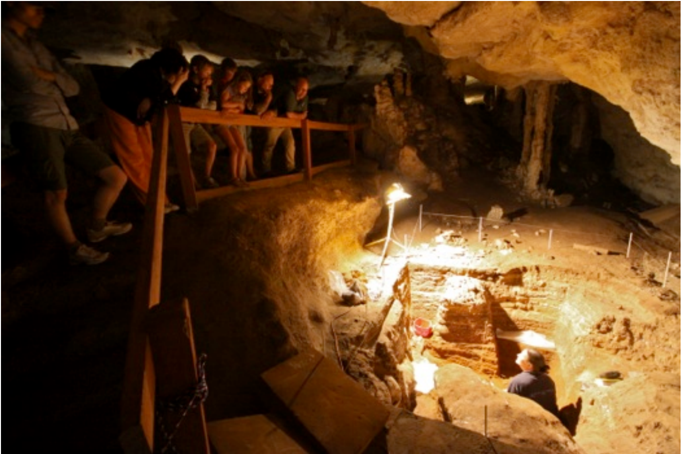
Figure 17. Visitors viewing the excavation site during a tour in 2012.

The CfoC project has yielded multiple outcomes for Naracoorte Caves. There are the scientific aspects that continue to yield interesting results and help address the “so what, who cares?” aspect of interpretation by showcasing climate change and other topical issues of relevance to visitors. It has also reinforced the value of ‘younger’ fossil deposits in the large roof window caves and highlighted the need for stronger recognition of these in the management plan (Reed, 2012). Methodologies employed during the project have reiterated the need for site conservation to be an integral part of research planning. Importantly, the results of the project have allowed new perspectives on interpretation of the Naracoorte Caves site. Given this, it would be appropriate to conclude this paper with perspectives on the new research in Blanche Cave and how it has changed the perception of the cave and the way it is interpreted. Who better to express these perceptions than those at the front line of interpretation at Naracoorte, the site interpreters themselves?