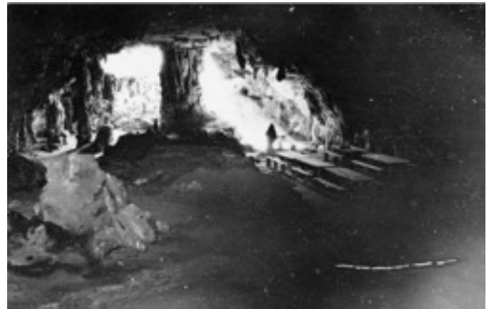
Figure 12. Blanche Cave entrance chamber c. 1923.

Despite the World Heritage nomination for Naracoorte being centred on Victoria Fossil Cave, the boundary of the property was set so that it encompassed the major caves, including Blanche Cave. It has only been in recent years that the full extent of the fossil resource at Naracoorte has been understood (Reed, 2012). In 2001