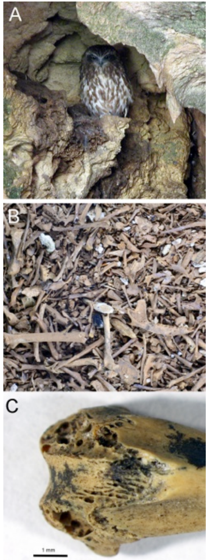
Figure 15 (right). A. Boobook owl roosting in Blanche Cave. Photo: Steve Bourne; B. Fossil bones from the third chamber dig. Photo: Liz Reed; C. Digestive corrosion damage to a femur Photo: Amy Macken.

Necessity is indeed the mother of invention and some of the most creative and innovative interpretation is done