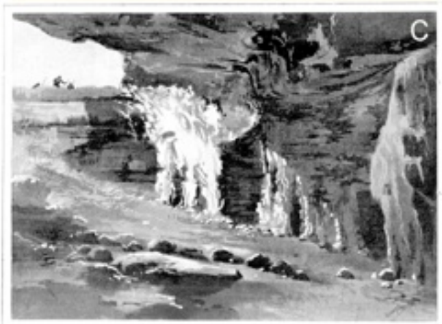
Third Chamber of Big Cave, Looking West.