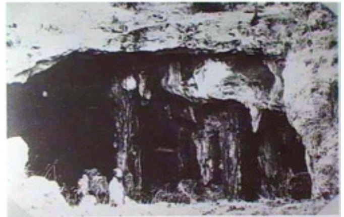
Left. Figure 3. A. Sediment cone beneath the third entrance in Blanche Cave. Photographer Thomas Washbourne, 1879. Collection of the State Library of Victoria, accession number H96.160/228; B. From Cassell's Picturesque Australasia (Vol. IV, page 92, 1889); C. From The Australian Town and Country Journal (13 April, 1895). Above. Figure 4. Blanche Cave, 1860 (photographer unknown). Tenison-Woods is visible on the surface in the first photo (State Library of South Australia, B36858 top, B36859 middle, B36860 bottom).