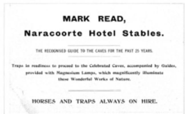
Figure 9. Advertisement from State Tourist Bureau booklet, 1909/1910, The Naracoorte Caves: "How to reach them" . From page 24.

A much-improved version of this form of lighting was trialed in 1883 ( The South Australian Advertiser , Tuesday 13 March 1883, page 6), and presumably used from that time on until electric lighting was installed decades later. When choosing a local guide, visitors were encouraged to seek out the services of those offering magnesium lamps: