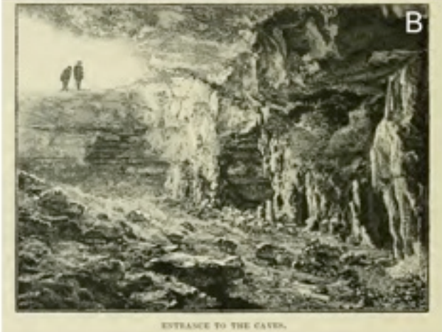
ENTRANCE TO THE CAVE.