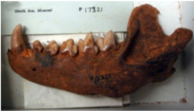
Figure 13. Sarcophilus dentary collected from Blanche Cave in the 1960s (P17321 – South Australian Museum).

Additional collection of material was made in 1984 in the third chamber. This yielded several ‘megafauna’ species including Protemnodon and Thylacoleo . Unfortunately these collections, although lodged with some sparse location details, were not collected in a systematic way with attention to excavation of the material according to stratigraphy.