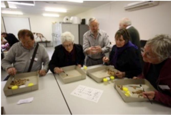
Figure 19. Friends of Naracoorte Caves members instructing Friends of Parks forum delegates in fossil sorting in the lab at Naracoorte Caves.

fauna found in the layers. The most amazing part I think is the possibility of two events happening and being recorded in the same deposit with the third cave opening being a series of solution pipes and larger animals being the victims along with smaller animals then a larger cave opening developing as we see the cave today and allowing owls to prey outside then leaving their pellets behind that can be a very important part of a palaeontologists research."