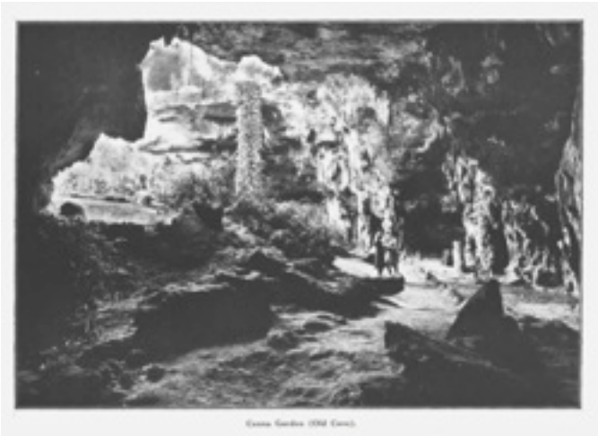
Figure 11. Canna garden beneath third roof window entrance. From Narracoorte, Caves and Town. Back to Narracoorte Celebrations 1924 .

“Blanche Cave demonstrates the Victorian attitude of a recreational ‘grotto’, becoming a social venue complete with steps, tables and benches. In contrast, the rich fossil beds discovered in Victoria Cave illustrate later attitudes towards scientifically valuable sites of minimal disturbance, appreciation and education”.