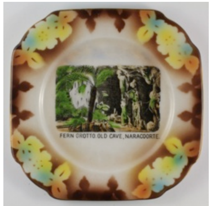
Figure 8. China plate with "fern grotto, Old Cave, Naracoorte" (collection of the authors).