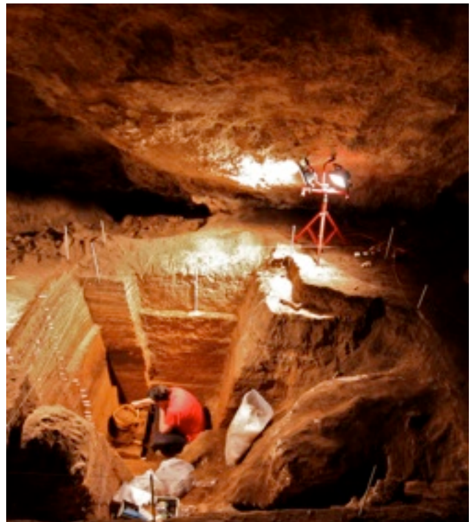
Figure 14. Excavating in Blanche Cave 2012.

Given the enormous concentration of small mammal bones in the Blanche Cave deposits it is surprising that Woods and others never considered the activities of predators to be responsible. Woods’ theory of animals trapped by rising flood waters does not hold up in light of the excavated evidence; however, smaller scale ‘flooding’ during storm events did lead to sediment movement