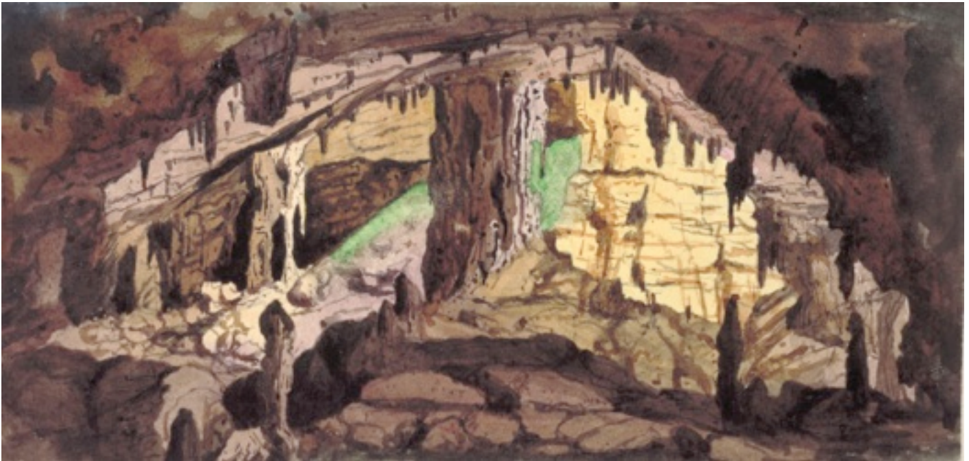
Figure 1. Stanley Leighton. (1868) Caves of Narracoorte, South Australia , watercolour, National Library of Australia http://nla.gov.au/nla.pic-an4623893 .

at once the natural beauties of the place will soon be a thing of the past”.