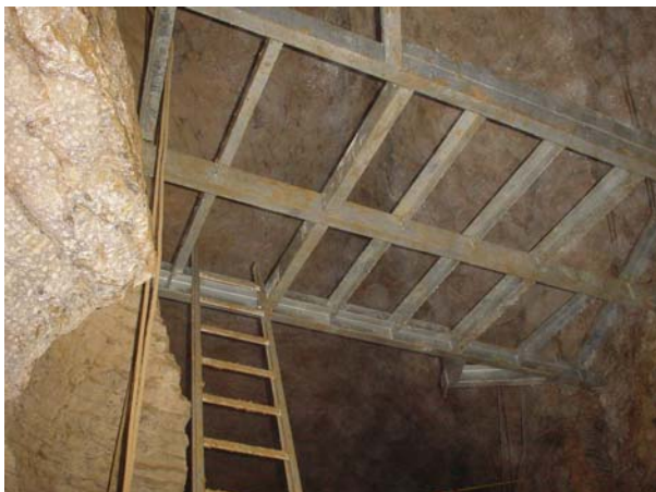
A bottom up view of incomplete raised tracking in Ruakuri Cave

Ruakuri Cave (adjacent to the Aranui show cave) is three kilometres past Waitomo village, and it was itself a show cave until in was closed on 6 February 1988. Unlike in Australia (except in a few cases), most land titles in New Zealand are 'centre-of-the-earth' – if one owns the land above, you also own the land below. Ruakuri was managed by the Tourist Hotel Corporation, the then operators of the Glowworm Cave and Aranui Cave . It was realised that the Crown (vested, effectively, in DOC), in fact, only owned the then entrance and a little more of the cave, while the rest was owned by the Holden family, and by the local council under Ruakuri Road.