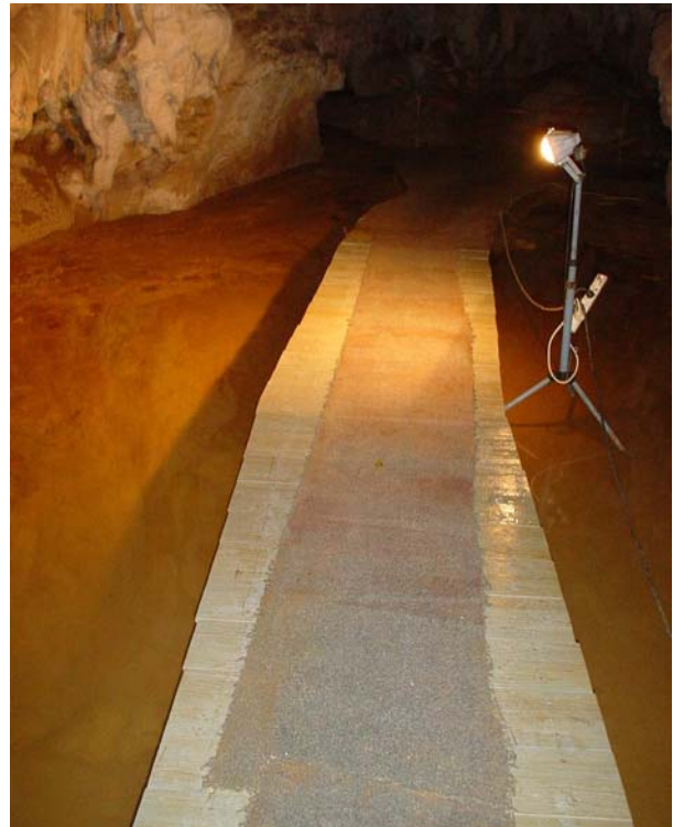
Incomplete raised tracking in the Spirit Cave

Very little change has occurred at the Glowworm Cave since my last visit – nor does it need to be, frankly. I have widely commented previously on its updating in this Journal, so I will not bore you with repetition. Needless to say, the cave is very well resourced, and managed, particularly given its massive visitation.