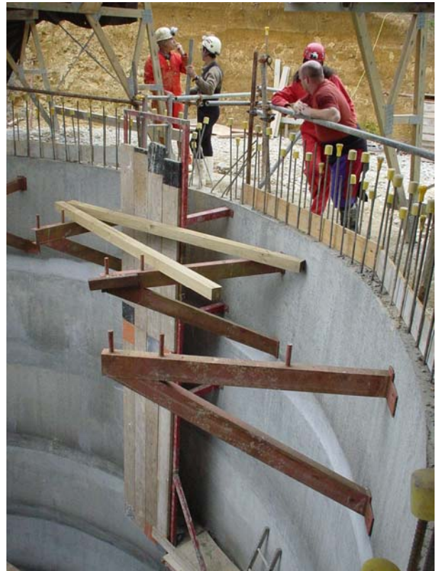
The group at the new excavated tourist entrance to Ruakuri Cave