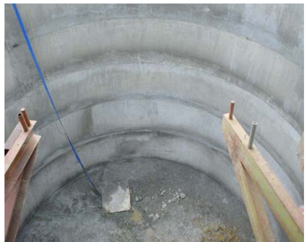
A view down the new tourist entrance