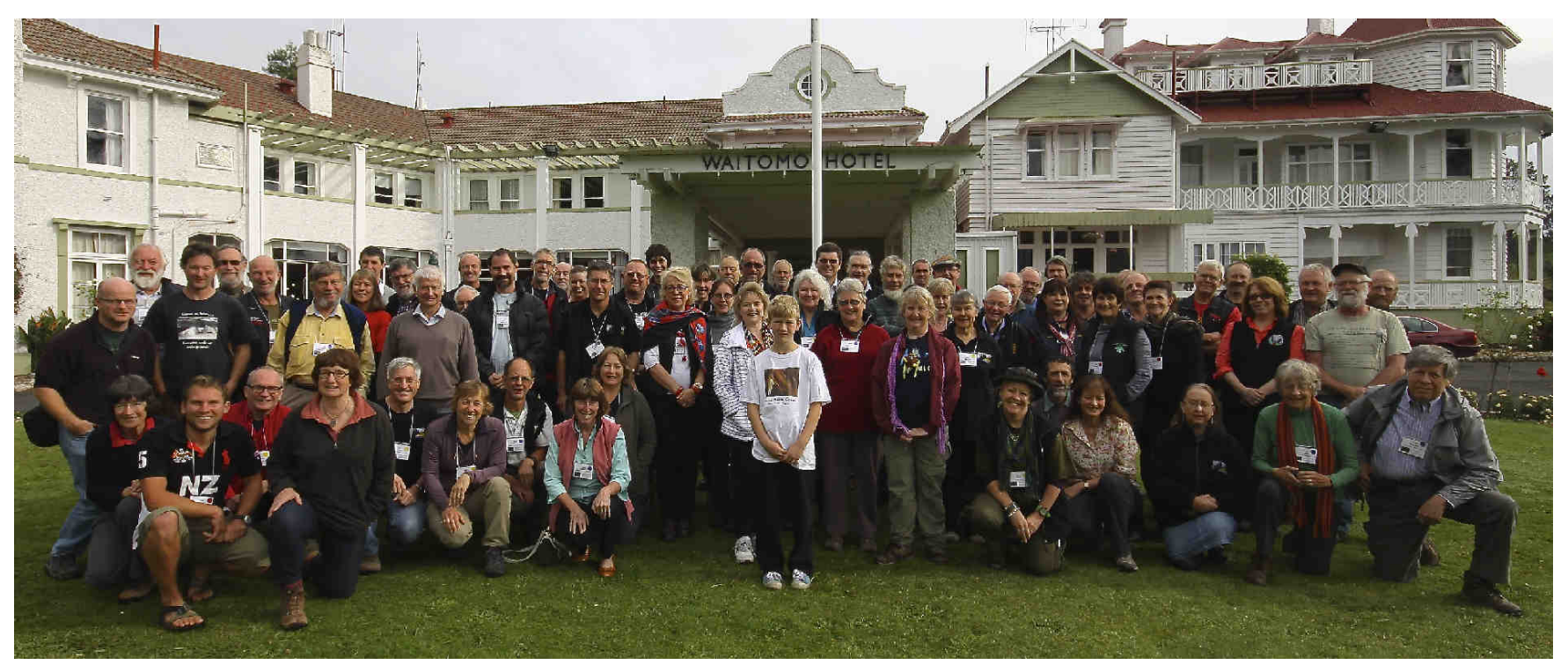
Conference Photo, Waitomo Caves, New Zealand