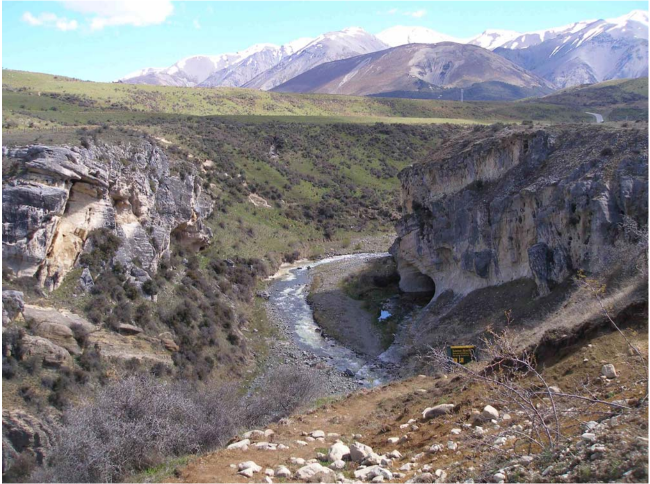
Broken River Gorge. Note the prominent limestone cliffs and the resurgence of Stream Cave at the lower right.