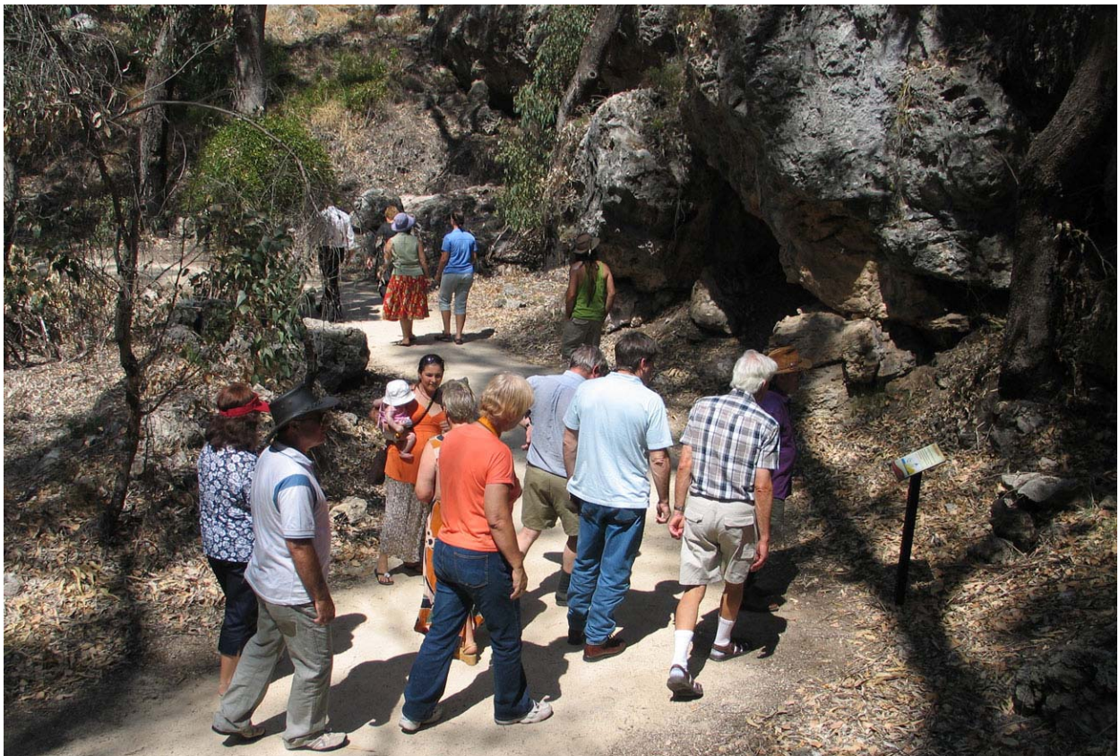
Interested visitors to Yanchep National Park enjoy the new signage along the trail