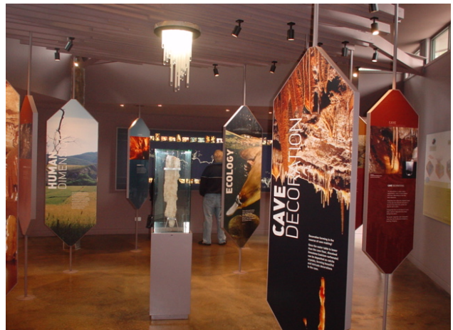
Displays inside the new Buchan Caves Visitor's Centre

Speaking of Buchan, I was down there a few weeks before our recent Conference, primarily to view the new Buchan Visitor's Centre. It's “okay”, but I was not thrilled, shall we say. Over $300,000 was spent on a relatively small architect-designed (as it would be..) addition to the old kiosk building, which itself has been done up. I am advised about half the dollars were spent on consultant fees... Sigh... Frankly, one could readily think of several who could (arguably...) have consulted much better and at a fraction of the cost. Sigh (again)... The extension is not, in my view, particularly functional, but there you go. I must say though that the new interpretation is quite well done, relatively extensive, and complete. There are numerous minor mis-descriptions and spelling errors, but it is infinitely better than the nil interpretative displays that didn't exist at Buchan previously. Incidentally, Buchan Caves has been granted the 17th ACKMA Conference , which will be held in Autumn 2007.