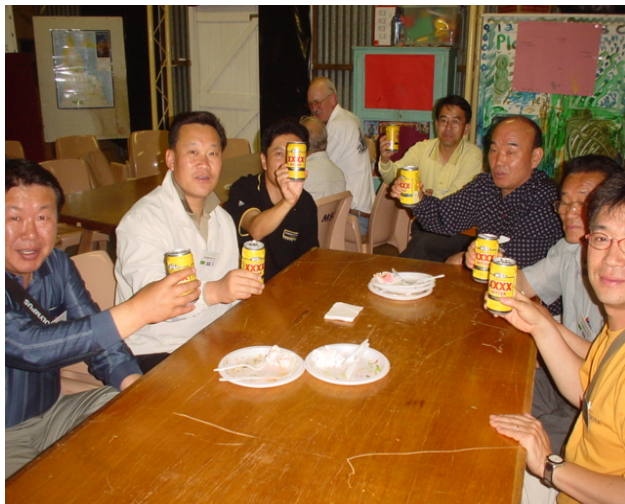
The Korean delegates, gaining a deep insight into Australian culture! – Conference 2003