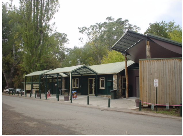
The new Buchan Caves Visitor's Centre