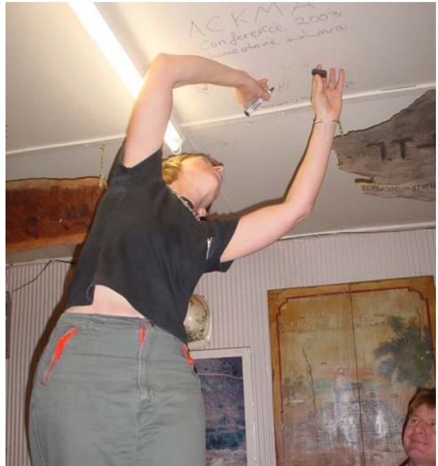
The President-elect (as she was then) defacing the ceiling of the Post Office Hotel, Chillagoe (with permission I might add!) – Conference 2003