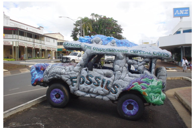
The Crystal 'cave' car, parked outside....