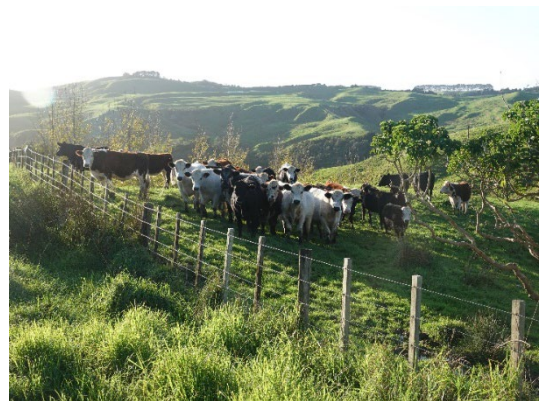
Figure 4: Rolling hills of lush grazing and curious cows encountered on the walk to and from the cave (right).

There was a short safety talk and check of equipment, then we walked about 500 m up an easy foot track to the start of the cave. We followed a track high along a ridge through grazing pastures (Fig. 4) and then descended into a thicket of larger trees to the cave's spacious outflow entrance.