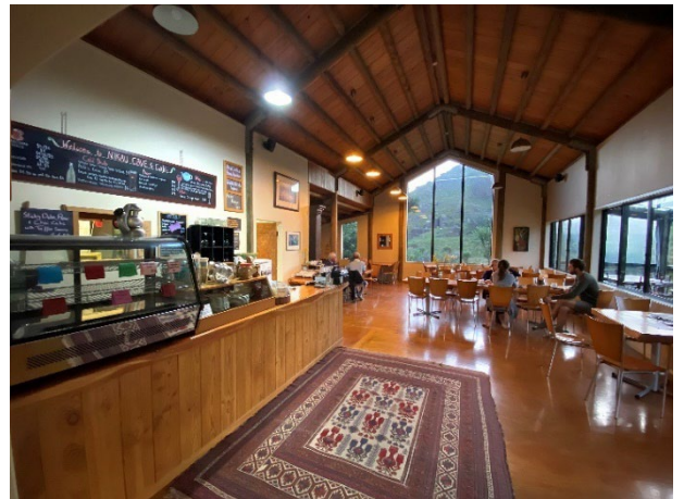
Figure 2: Inside the café looking towards the beautiful view and limestone outcrops (right).