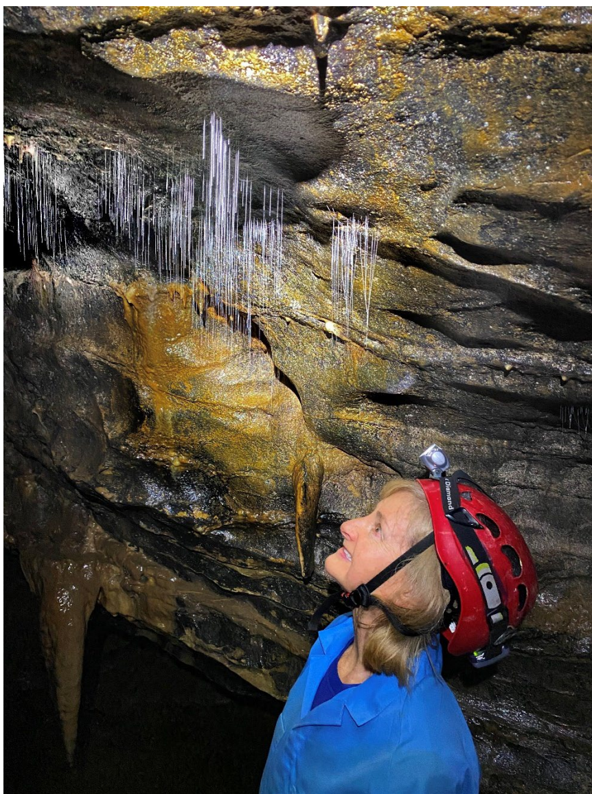
Figure 13: Glow worms can easily be observed close-up in many sections of the cave (left).

We also saw two of the resident eels that live in the active stream way. While not true troglobites they have adopted the cave as a place to live.