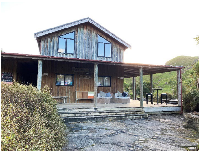
Figure 1: Café and reception building at Nikau Cave (left).

Upon arriving at the property, our first sight was the impressive building which serves as visitor centre, accommodation and cafeteria (Figs. 1, 2). From inside there is an amazing panoramic view through the enormous windows that face the striking grass covered hill with limestone outcrops.