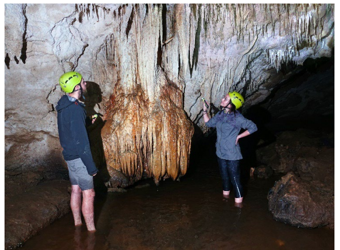
Figure 8: Stalactites that are coloured brown / red by humic and fulvic acid derived from decomposing vegetation at the soil surface (right).