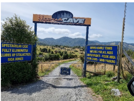
Left: Ngarua Cave road entry

Following the successful format at other conferences, morning presentations will be held in the Golden Bay High School Hall, followed by afternoon field trips, with a picnic lunch, except for the full day described below.