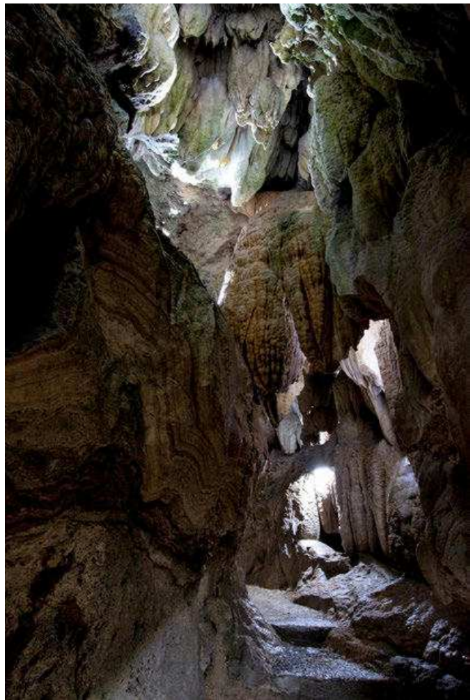
The Coral Canyon.

The upper cave was discovered during quarrying operations in 1863. The tufa was in demand as a construction material as it