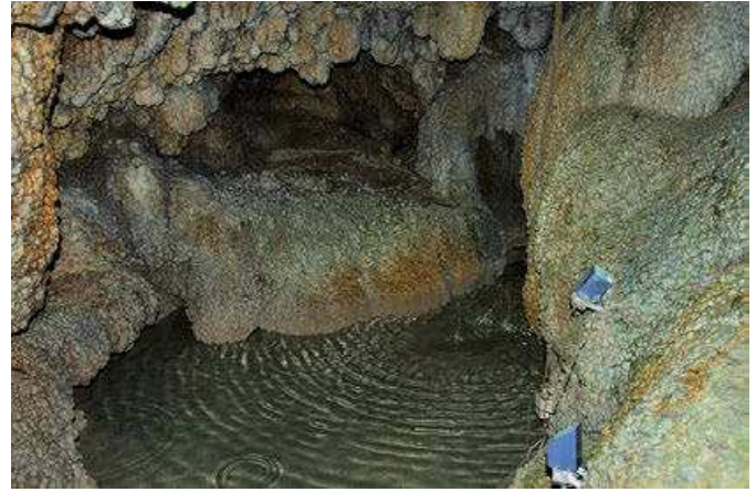
Botryoidal coral-like speleothems above a small pool.

In 2012, the caves were entirely relit using, as the Höllgrotten Website states “cutting edge LED technology, affording the very first opportunity for visitors to enjoy a proper view of the stone’s vast range of shapes and colours in all their subtlety”. There is one place in the cave (the Enchanted Castle) where coloured lights are used. The room, which has a shallow pool about 3 metres long and 2 metres wide is bathed in white light but soon after visitors enter, the lights go through a sequence of orange, reds and purple followed by blues and greens. I can’t say I am much of a fan of coloured lights in caves but this did strike me as being pretty spectacular. Perhaps my brain is rotting?