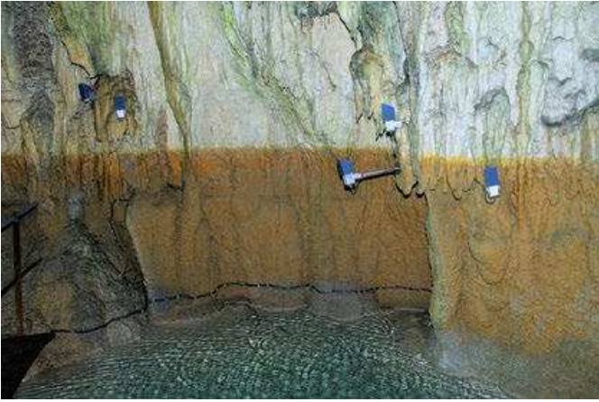
It is difficult to avoid noticing the LED light fittings in the Enchanted Castle.