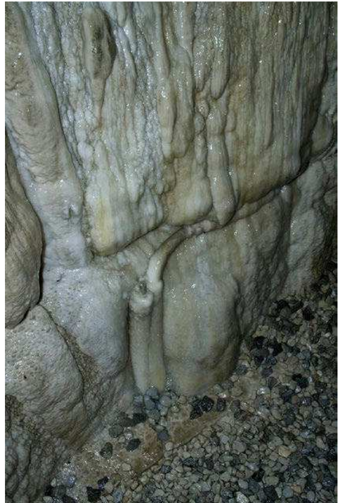
Calcite encrusted electrical cable