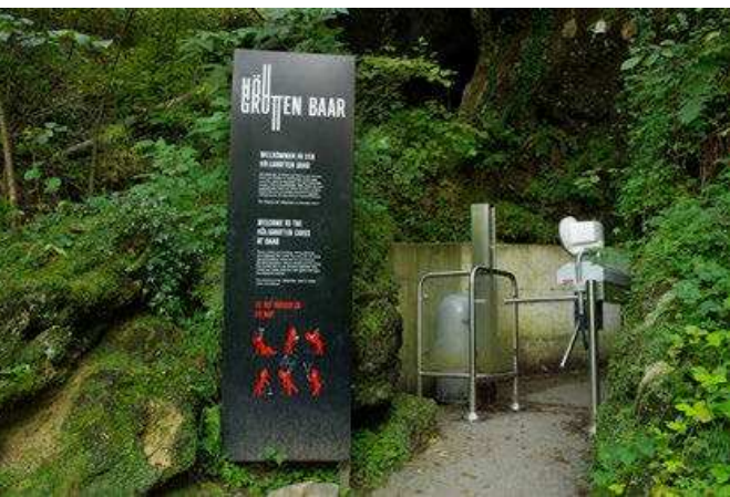
Entrance to the Upper Höllgrotten Cave

Accretion caves are not at all common in Australia and the best example I can think of is in the Ravine Karst area in the Kosciuszko National Park in New South Wales where calcium carbonate from thinly bedded and impure limestones has been redeposited further downslope, generally over cliffs of sandstone and shale, creating a number of cavities, the largest of which (Milk Shanty Cave) is about 15 metres long and 2-3 metres wide and high.