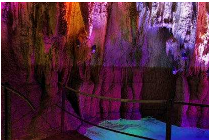
Coloured lights display in the Enchanted Castle.

were discovered in 1892 and in 1902 and Schmid purchased neighbouring plots of land to ensure he would be able to link up all the grottos and preserve the cave system for posterity. Today, the caves - as well as the surrounding land and a nearby restaurant - are still owned by the Schmid family through a trust set up in 1942.