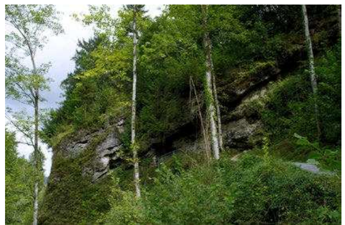
View of the tufa deposit/ cliff from the track between the upper and lower caves.