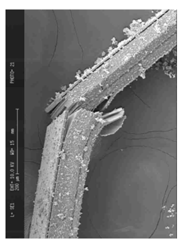
Figure 1. An SEM image of gypsum angel hair showing a prismatic monoclinic habit and perfect tabular cleavage (scale bar 200 µm).

secondary powder and crystal surface growths (figure 2). Single crystal angel hair measured between 57-109 \mu m, across the b-axis and 25-137 \mu m for the growth covered angel hair, although it was difficult to determine if measurements were across the a or b-axis. Secondary crystal growths consisted of acicular and euhedral crystals and fine powder that appeared to be single crystals or rosettes of micron-scale crystal aggregates.